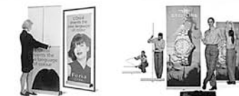
Banner stands & Retractable displays