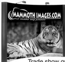
Trade show graphics

Overall dimensions: 59.375"H x 73"W x 19.25"D