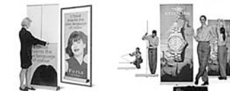
Banner stands & Retractable displays