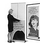
Banner Stands & Retractable Displays