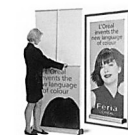
Banner Stands & Retractable Displays