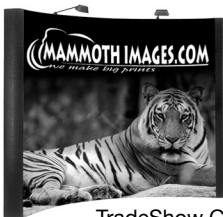
Trade Show Graphics

Images should include a 2 in. (50mm) top bleed and a 7-7/8 in. (200mm) bottom bleed for the purpose of attaching the panel graphic to the system hardware. This area will not be visible. (The Desk Bug model requires a 1-3/16 in. [30mm] top bleed and a 7-7/8 in. [200mm] bottom bleed.)